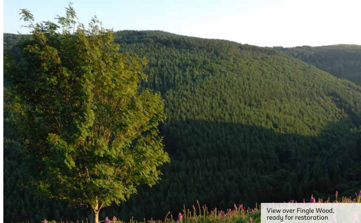
View over Fingle Wood, ready for restoration

It is in these areas that more light enters the wood, there is a less dense, acidic needle carpet and more ground flora survives. Many of these are specialist plants that are closely associated with ancient woodland, due to their poor dispersal rates and adaptation to particular woodland conditions. Manipulating light levels by gradual thinning can allow natural regeneration of native trees and spread of ground flora.