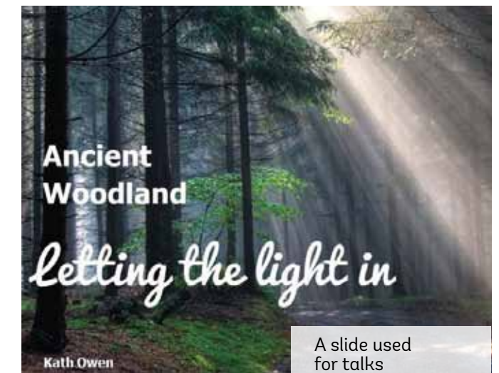
A slide used for talks

This body of data links us back to our woodland heritage and gives a greater appreciation of how trees have supported human development.