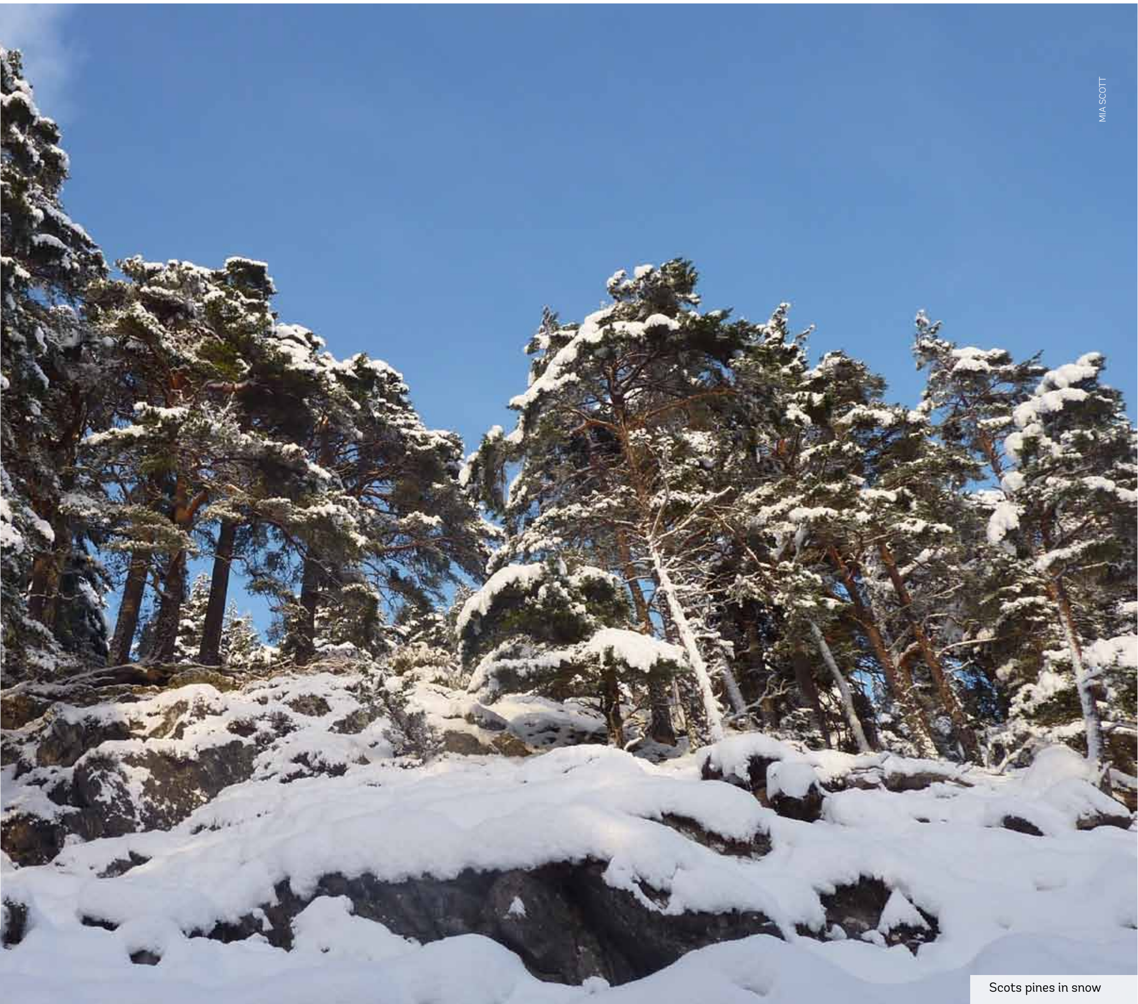
Scots pines in snow