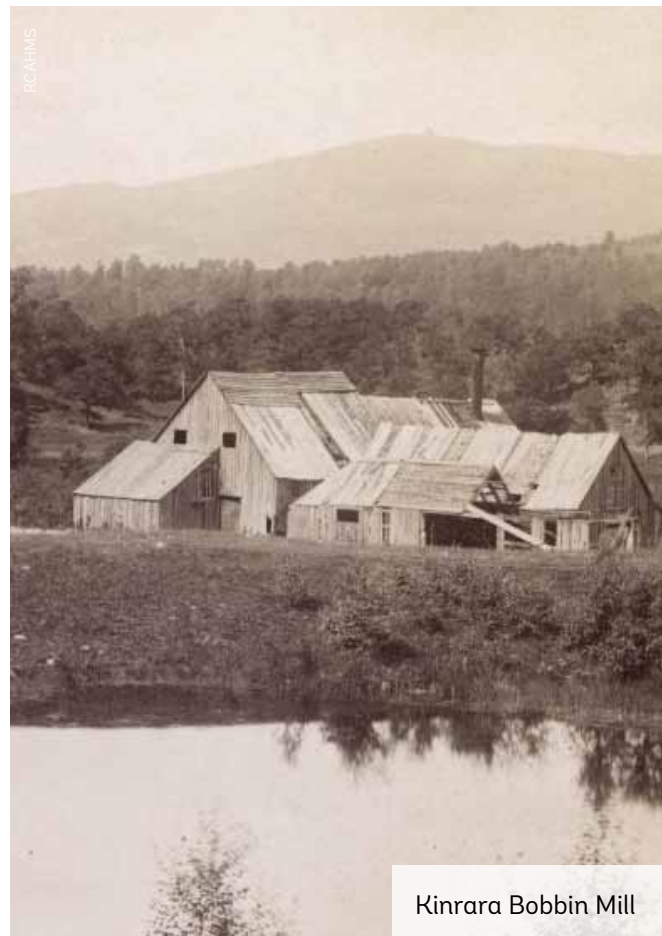
Kinrara Bobbin Mill

These are just two examples of the volunteer roles supporting the ancient woodland restoration project, and many other areas of the Woodland Trust. Others include assessing plantations on ancient woodland sites to evaluate opportunities for restoring them. Volunteers are highly valued and dedicate a significant amount of energy and time to the work of the Trust.