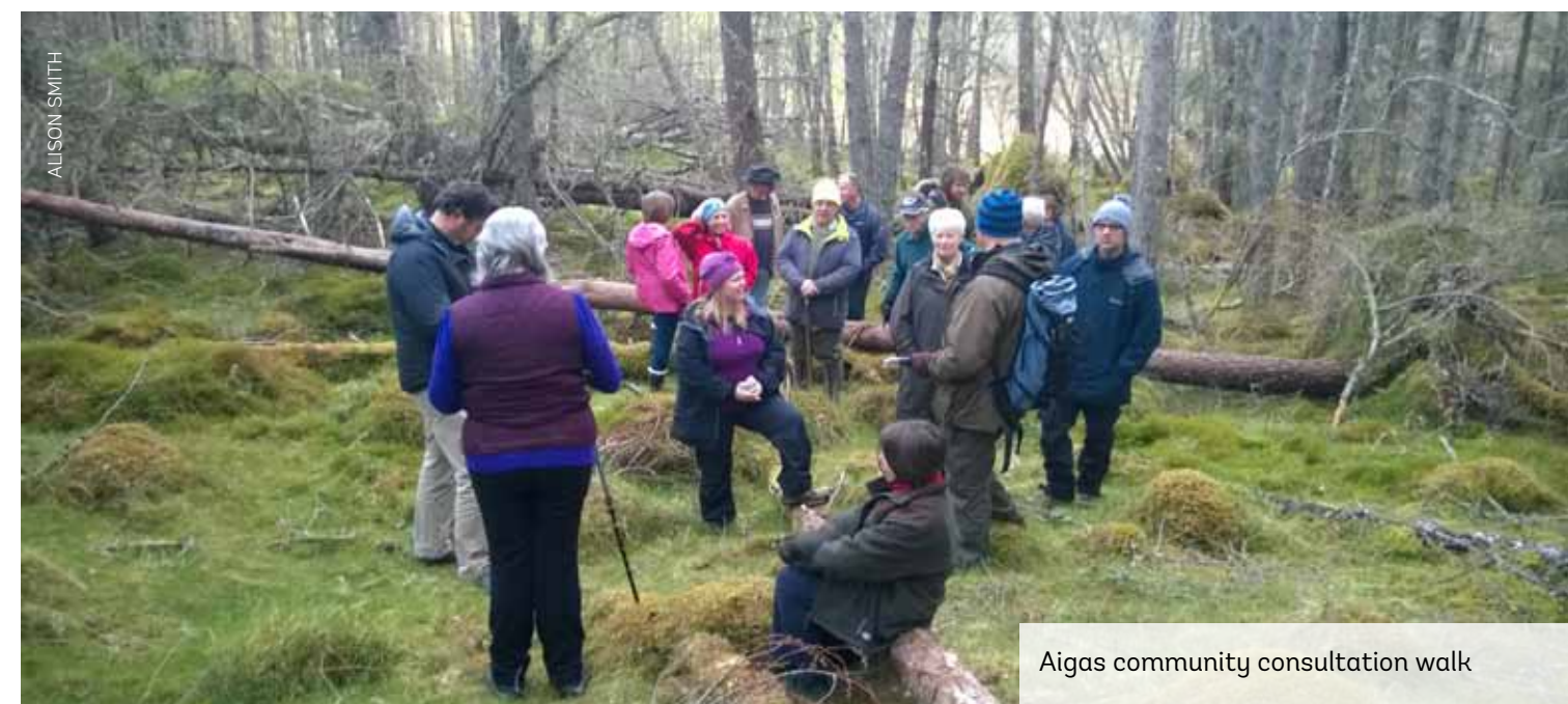
Aigas community consultation walk