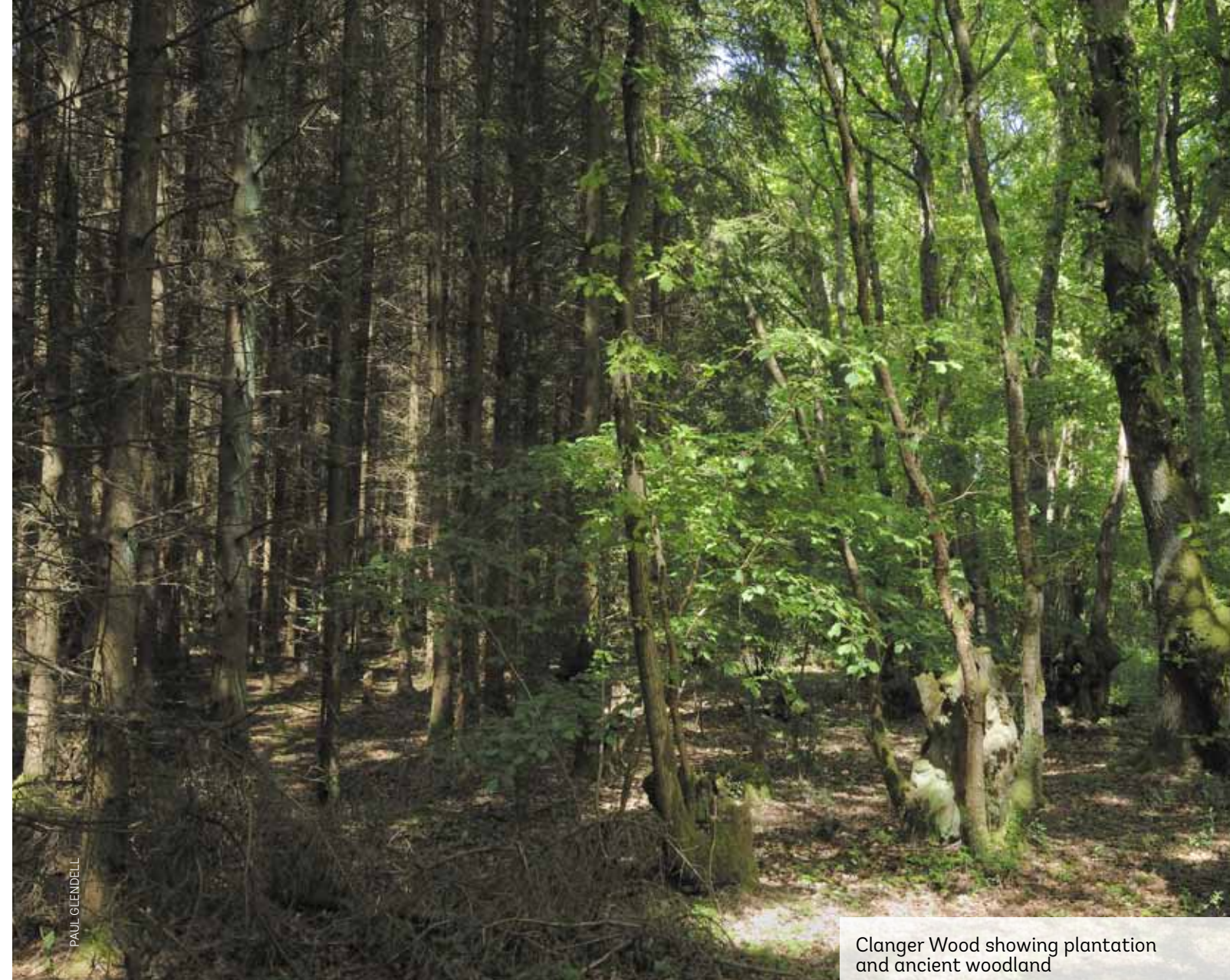
Clanger Wood showing plantation and ancient woodland

Designer: Simon Hitchcock (Woodland Trust)