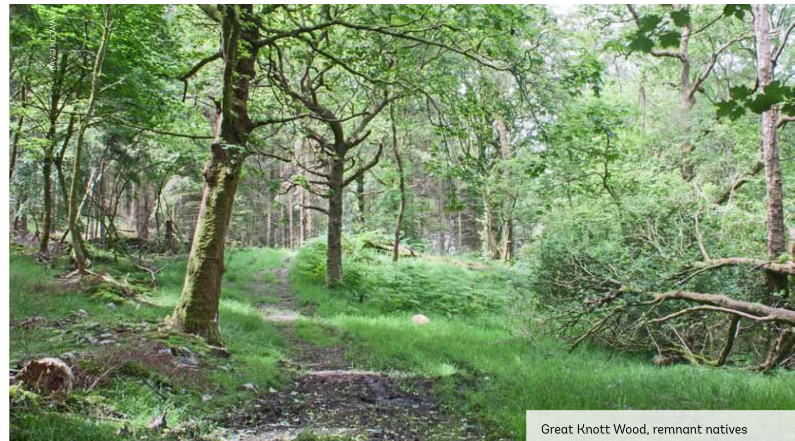
Great Knott Wood, remnant natives