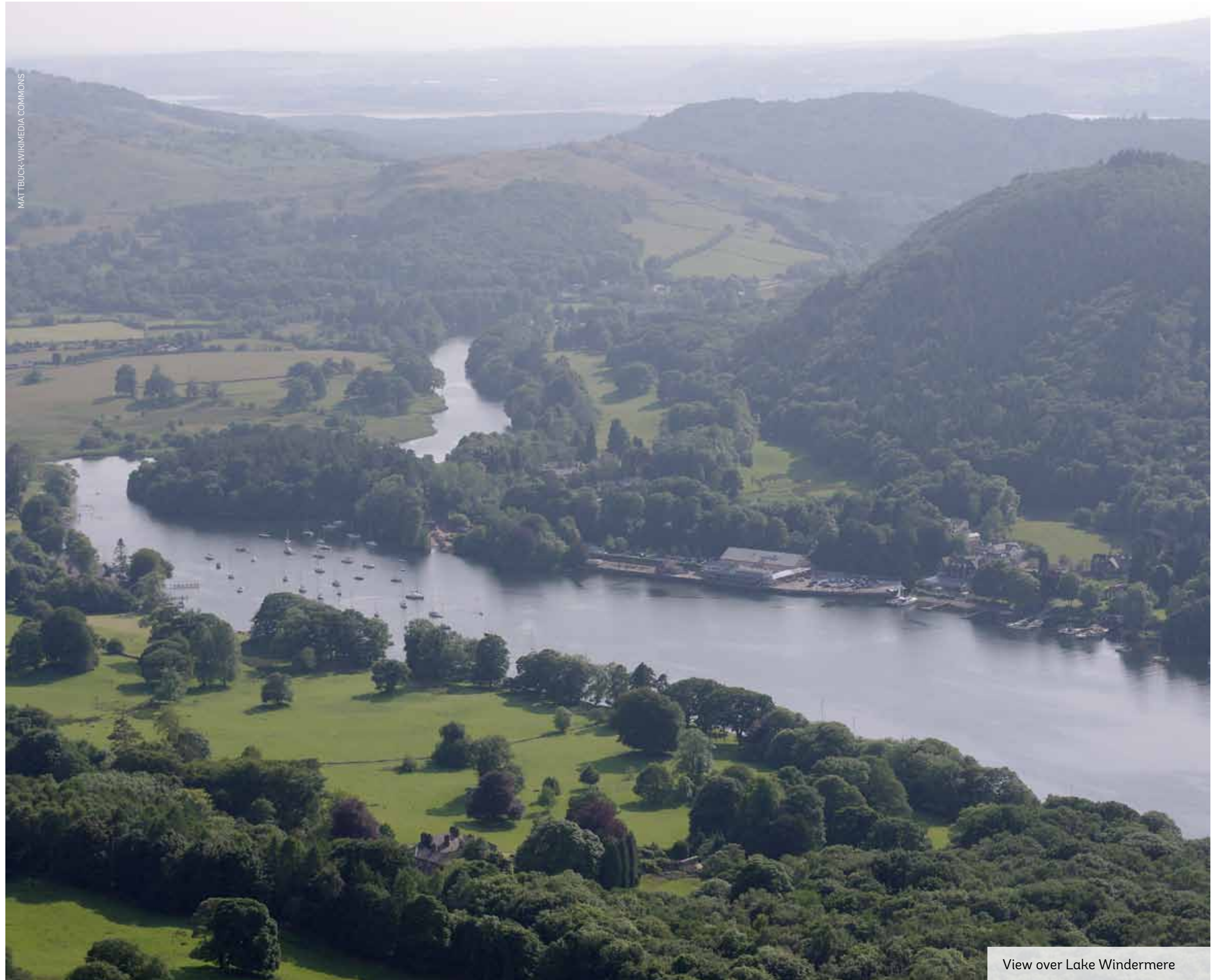
View over Lake Windermere

There have been many challenges along the way though. For example, working with such a large number of third-party landowners on one project has been complex. Many of the woods either changed ownership or manager over the course of the project. There have also been major changes