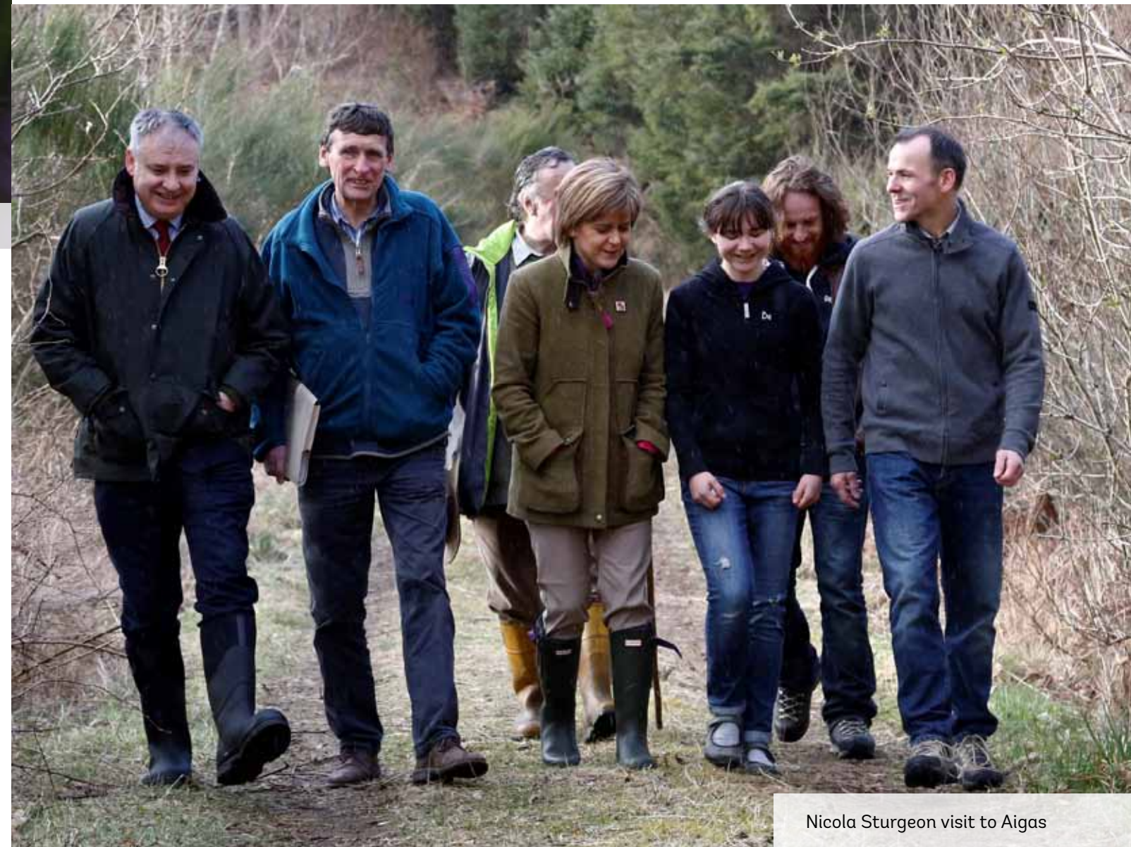
Nicola Sturgeon visit to Aigas

The long-term goal of the community, who can all see the forest from their homes, is to create a thriving wood, balancing the needs of wildlife and local people. They hope to provide a home for a diverse range of flora and fauna, and a place for human enjoyment, while producing an income to reinvest in the forest and support activity in the wider glen. It is an ambitious plan, but one the whole community is committed to delivering.